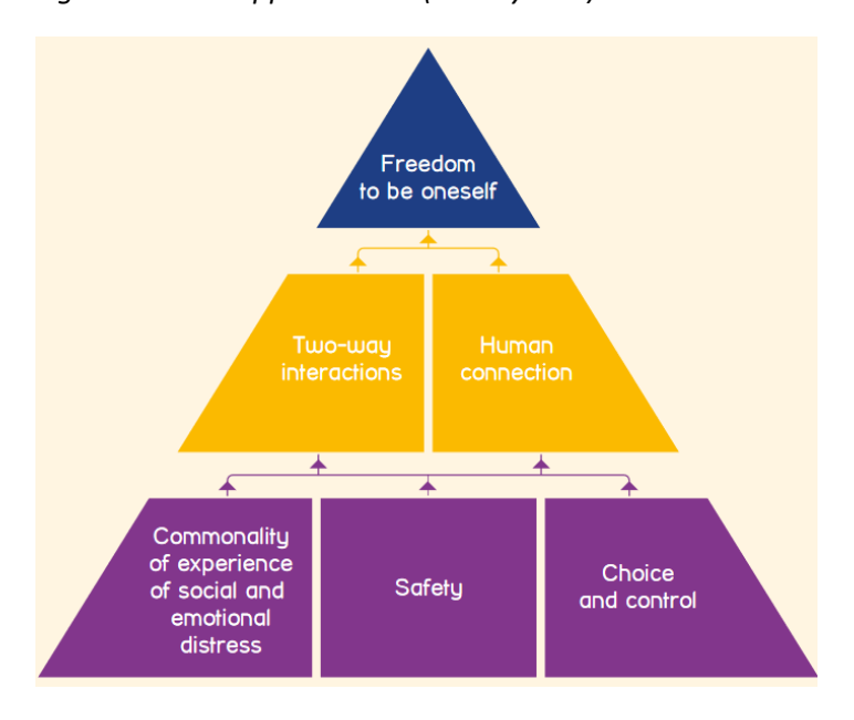
Figure 1: Peer support values (Side by Side)

Peer support can benefit people who experience mental health problems<sup>1213</sup>. The McPin Foundation and St George's, University of London collaborated to evaluate the impact of Mind's Side by Side programme<sup>14</sup>. This was a large-scale peer support project aiming to improve access to community peer support across England. Through the project, six 'values' were developed which defined what lay at the heart of good community-led peer support. These values are shown in Figure 1 (below).